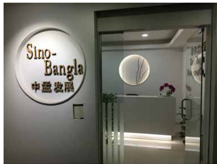
世纪发展集团“一带一路”业务版块——中孟发展有限公司 Office of Sino-Bangla Development Co. Ltd, the subsidiary of Century Line Development Group that focuses on the Belt and Road Initiative, in Bangladesh