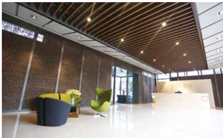
坝上春秋艺术园 Century Times Art Park

1983 年，于学文先生安排和陪同美国著名商业杂志《福布斯》董事长和主编福布斯先生一行由延安至北京的中国历史上第一次摩托车和热气