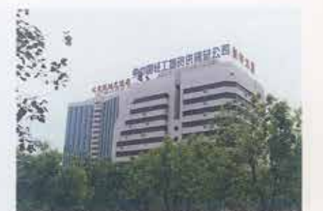
由公司合资建造的亚洲大酒店和新中大厦外景 The outdoor scene of the Asia Hotel and Xinzhong mansion in Beijing built by Century Line with Chinese partner.