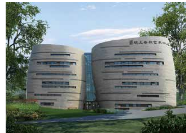
已落成的天津坝上春秋艺术中心 The completed Century Times Art Center in Tianjin