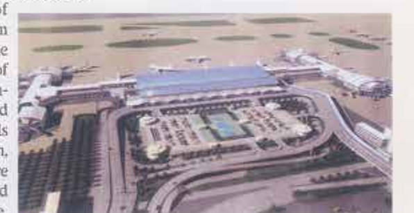
由公司提供冷水机组等空调和制控设备的北京首都国际机场航站楼外景 The outdoor scene of the Terminal Building of the Capital Airport whose chillers, air terminals and BA systems are supplied by Century Line.