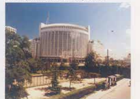
由公司提供空调制冷及其配套设备的外交部办公大楼 The office building of the Ministry of Foreign Affairs whose air-conditioning and supportive equipment are supplied by Century Line.