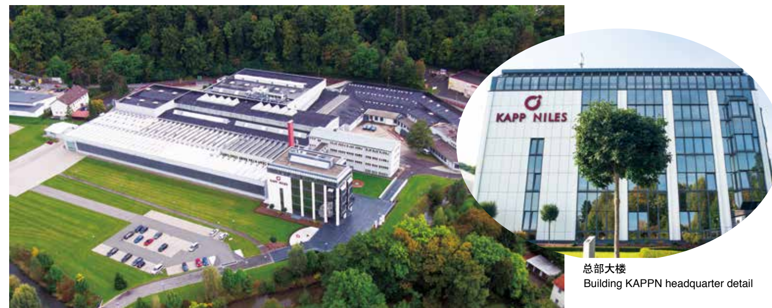
总部外景图 KAPP headquarter top view

接着冯国先生介绍了卡帕亚洲科技（嘉善）有限公司，他说：“这是一家具有世界最先进的金刚砂CBN砂轮制造专业厂家。由德国卡帕控股公司投资建成，2006年落户浙江嘉善大云工业区，是当地政府引进的首家德资企业。企业所在的地理位置优越，距沪杭高速出口仅3公里，到高铁嘉善南站1公里，到上海虹桥机场一个小时车程、杭州萧山机场或浦东国际机场仅需1.5小时。公司占地面积11亩。卡帕亚洲科技（嘉善）有限公司现已成为嘉善大云工业区的标杆企业，成为中国第一家具有世界最先进的金刚砂CBN砂轮制造和重磨的专业厂家，并为客户提供最快最佳的技术服务和备品备件。目前我们已通过了ISO9001质量管理体系认证、ISO14000环境管理体系认